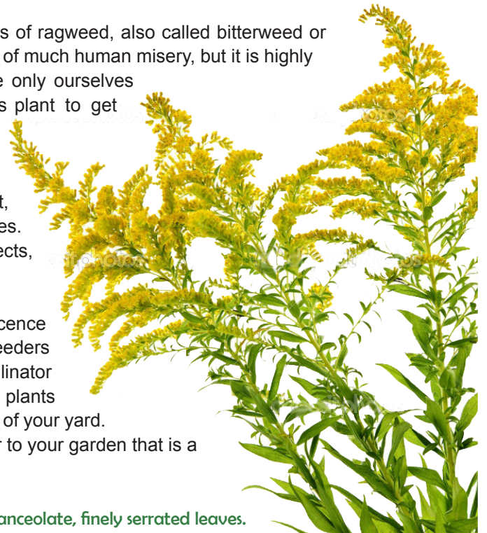
Goldenrod ( Solidago spp. ) has showy yellow flowers and lanceolate, finely serrated leaves.

Fortunately, many people are now aware of goldenrod's innocence and recognize its beauty and value, thus encouraging plant breeders to develop many varieties that are perfect for perennial and pollinator gardens. If it does not already grace your yard, establish some plants out in a flowerbed, in a natural border, or in an overlooked corner of your yard. When you do, you will be adding a beautiful late season bloomer to your garden that is a great nectar source for bees and butterflies.