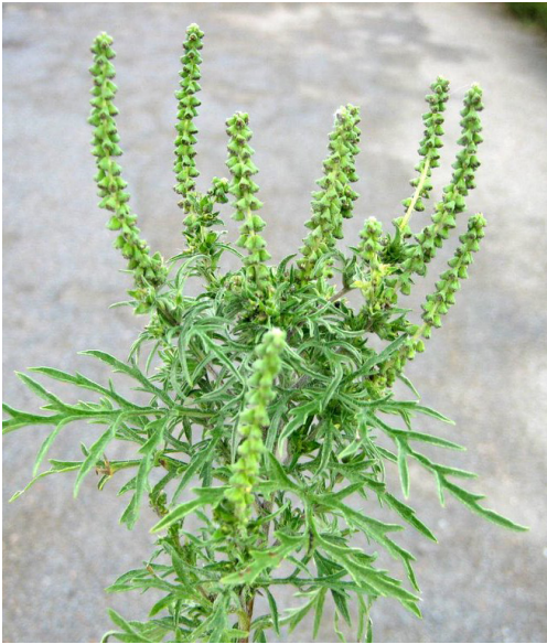
Ragweed ( Ambrosia spp. ) is an inconspicuous plant with small green flowers and deeply pinnatifid leaves.

Eye-catching golden plumes swaying in the breeze along roadside ditches, old fields, and meadows are a sure sign that fall is approaching. Considered a noxious weed by many, goldenrod ( Solidago spp. ) is a largely unappreciated Georgia native perennial that is often unfairly blamed for stuffy noses, sneezing, and watery eyes from allergy sufferers. However, the true villain is usually ragweed ( Ambrosia spp. ), which blooms at the same time of year and in similar environments.