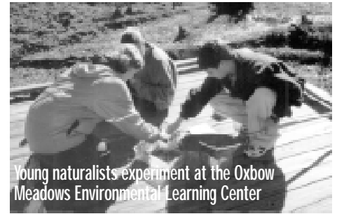
Young naturalists experiment at the Oxbow Meadows Environmental Learning Center

In addition to tours, Columbus State University courses, guided trail walks, summer camps, school field trips, birthday parties, and seasonal events, all are invited to Oxbow on the second Sunday of each month for a special nature program. For more information, call (707) 687-4090 or visit http://oxbow.colstate.edu .