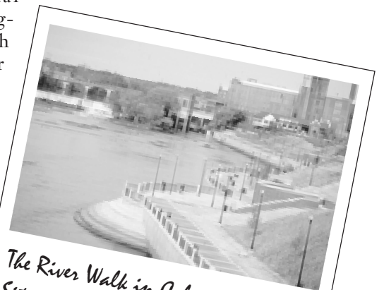
The River Walk in Columbus. Site of this year's EEA conference.

On the back of this newsletter, read about Georgia environmental education's biggest award bash of the year. For lodging reservations call (706) 322-2522 and tell them you are with the EEA conference. Rates are $56/night (Includes a breakfast buffet). Call early to ensure a reservation!