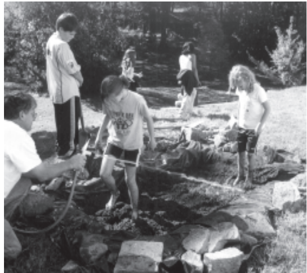
Building the bog garden

with an environment they may never have encountered. Finally, we have an outdoor science area that intrigues students. A Venus Fly Trap or Pitcher plant is fascinating to students. Even students who do not typically like science find the bog garden a source of learning and enjoyment.