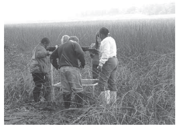
Students measuring the changes taking place in a salt marsh ecosystem.