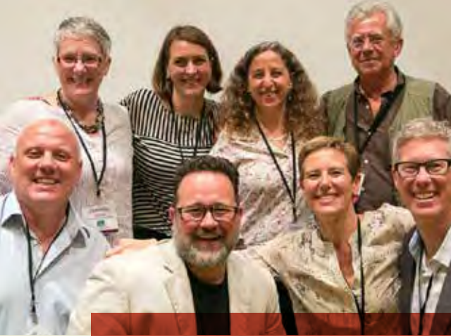
Children & Nature Network 2015 Conference