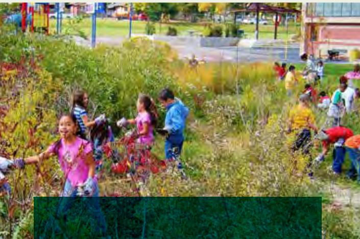
Children across Denver received Learning Landscapes after two bonds passed to transform school playgrounds.

CHICAGO PUBLIC SCHOOLS (CPS) passed a daily, district-wide recess policy that included funding for playgrounds at schools where there were none and to replace playgrounds for those in need. Around that time, the two water utilities in the City of Chicago were looking for ways to control stormwater through green infrastructure. HEALTHY SCHOOLS CAMPAIGN and OPENLANDS initiated discussions among the school district and water management agencies to achieve mutually beneficial goals, which ignited the SPACE TO GROW initiative. The initiative facilitates the school district/city partnership and provides additional expertise, design, use, and maintenance for school ground transformations that