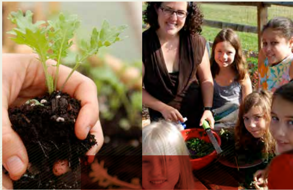
Children in Washington D.C. benefit from a district-wide School Garden Program.

So, we have a choice to make. We can let communities figure out how to gather their own funding and expertise to follow this trend of converting schools into safe, rich places for nature contact. Or we can pull together the leaders in the field, expand the network to other relevant sectors, and collectively coordinate funding, policy change, partnership building, training and community engagement to strive for deeper impact with higher rates of success in more communities. We believe that a coordinated effort is the only way to achieve scale and to reach beyond the well-resourced communities into places where children need green schoolyards the most.