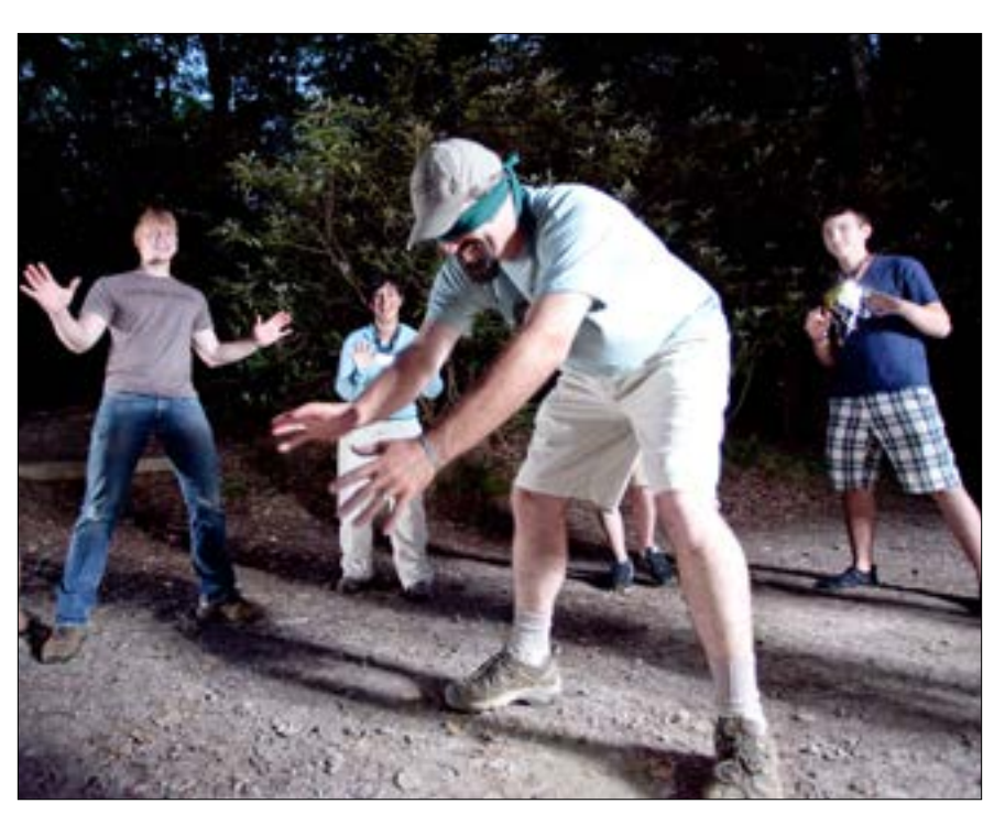
To simulate echo location, a group plays "Bat and Moth".