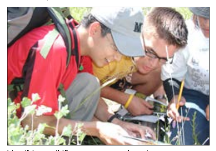
Identifying a wildflower to genus and species.