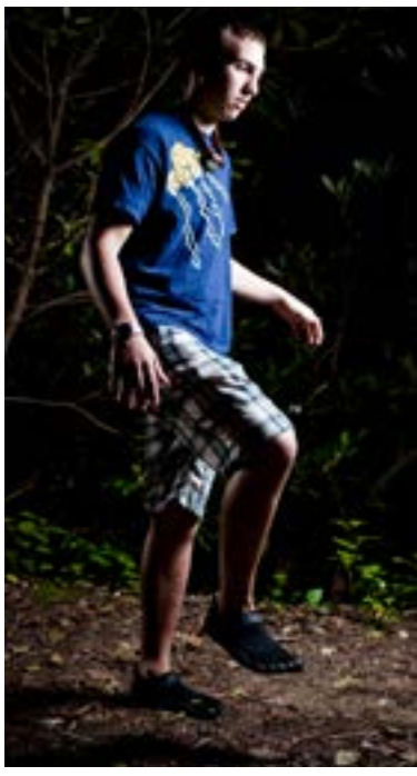
The right way to walk at night."

encouraging an enhanced auditory experience. These methods can be effective and allow for a safe and educational experience.