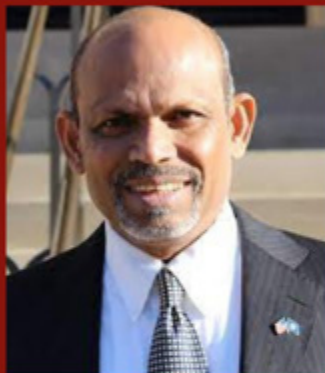
Georgia Senator Sheikh Rahman Chair of the Senate Study Committee on Outdoor Learning