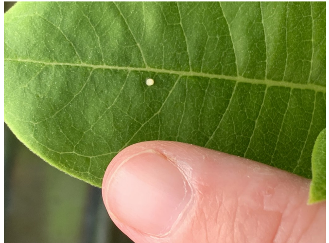
A Monarch egg discovered near Augusta in April.

*The Symbolic Migration program is written with schools as our main audience but families, organizations, and other groups are welcome to participate. Adults can participate as well; there is no age limit.