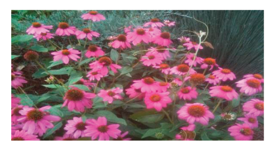
TIP #3: Use Nature Journals every time the class goes outdoors. These journals can be entirely hand-made or simple store-bought report folders, but each should have a student-created cover that relates to the natural world and a way to add pages. Require student observations, measurements, sketches, lab sheets, and so forth in the journals.

TIP #2: Use sensory exercises to quiet your students before beginning an outdoor lesson. Remind students that the primary tools they will use outdoors are their eyes, ears, nose, and sense of touch. Gather students in a circle and try this 'listen and share' activity. Ask each person to listen quietly and choose a particular sound. Then have each student take a turn sharing information about the sound s/he chose, without repeating any other student exactly. If one student says, "I heard a bird singing," the next student who heard a bird will have to say it differently, such as, "I heard a bird that sounds like this ..." This exercise helps sharpen students' listening skills and allows time to become calm and focused.