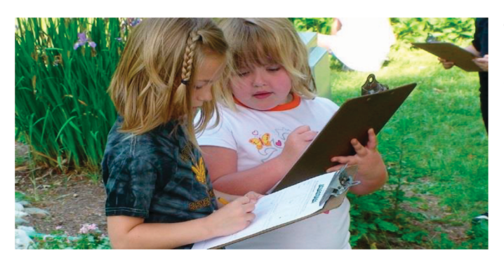
TIP #4: Clipboards are desks, trash bags are seats Prepare a classroom set of clipboards and have them ready to go. Attach the papers you will need ahead of time and have each student carry his or her own clipboard. Light-weight, rain-resistant clipboards can be made from foam core and pinch clips. Students can sit on folded trash bags, which are light and reusable.